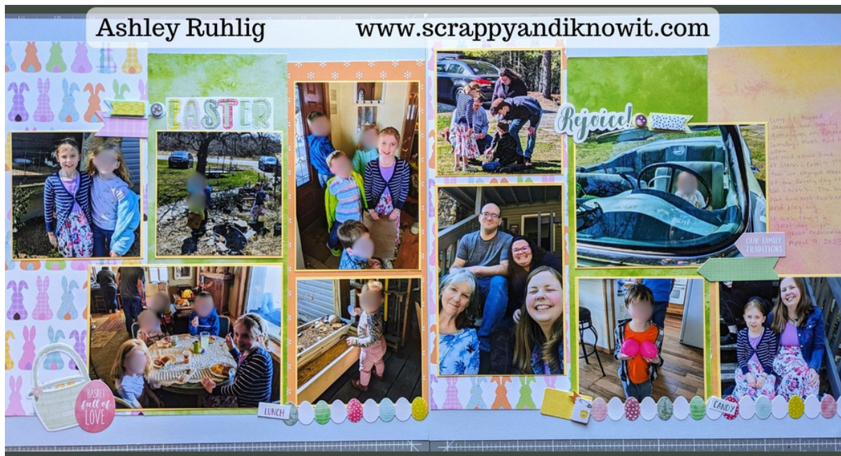
Original instructions posted in the Creative Memories Blog on 3/8/2024

Step 1: Select 12x12 papers/cardstock for your base and 3 other patterns for your strips.