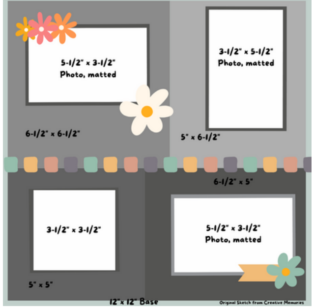
Original instructions posted in the Creative Memories Blog on 5/18/2022