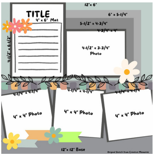
Original instructions posted in the Creative Memories Blog on 11/12/2022