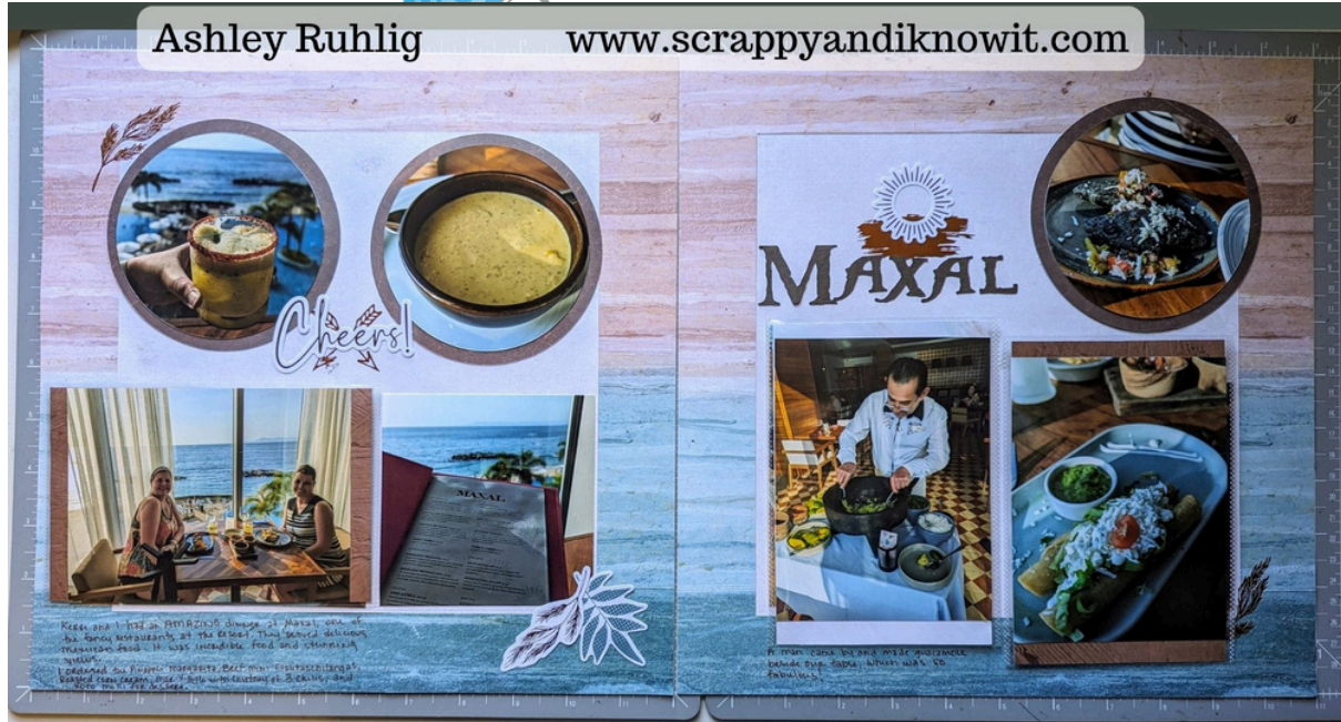
Original instructions posted in the Creative Memories Blog on 1/12/2024

Step 1: Select 12x12 papers/cardstock for your base and another few designs to layer and mat with. Cut 2 papers to 11-1/2" x 11-1/2" and layer on top of each of your bases. (My base is wider in the picture.)