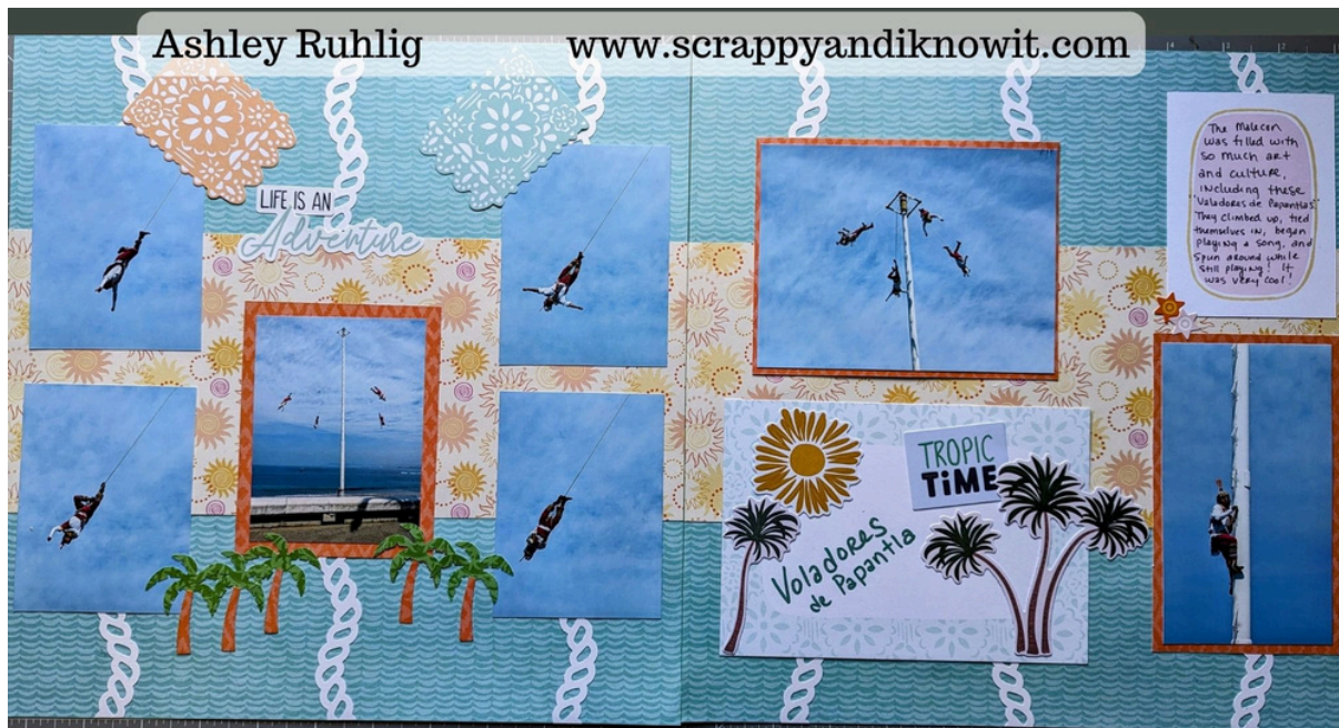
Original instructions posted in the Creative Memories Blog on 1/12/2024

Step 1: Select 12x12 papers/cardstock for your base and a couple of other coordinating colors/papers.